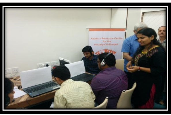
Volunteers Training Programme at XRCVC, Mumbai 06-March-2017 to 12-March-2017