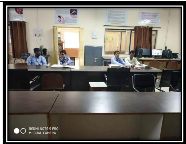
Student using Daisy Player Device