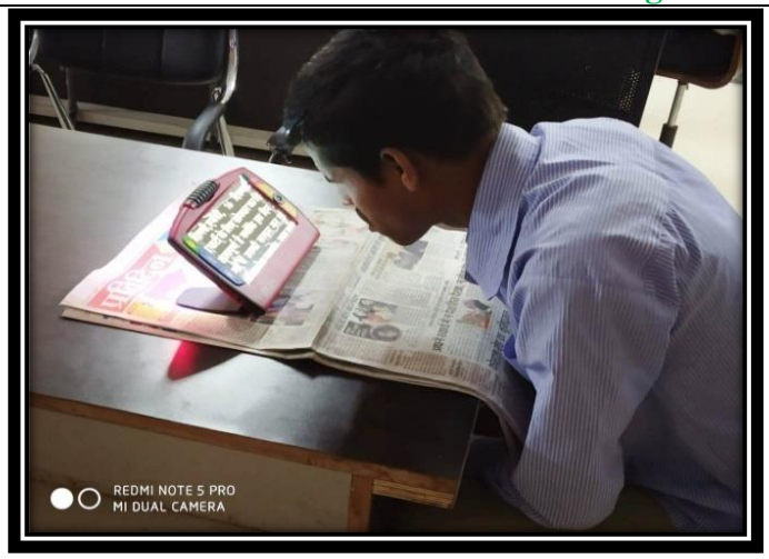
Student using Ruby 7 HD Device for Reading