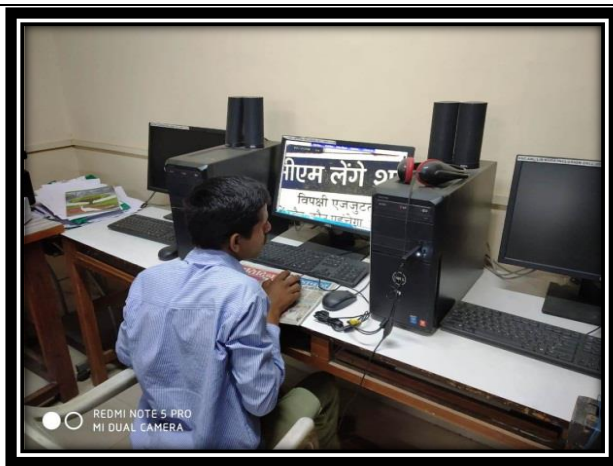
Student using Bonita Mouse Magnifier